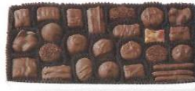
Milk Chocolates Pure milk chocolate goodness. Delivered in seasonal wrap. 1 lb $30.00 #550326