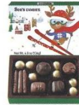
Skiing Reindeer Box Beloved See's Classics. 4.8 oz $13.00 #510627