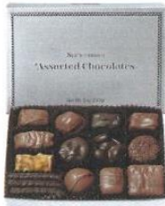
Silver Assorted An assortment that shines on its own. 8 oz $17.25 #506542