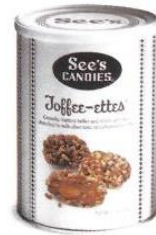
Toffee-ettes® Crunchy toffee, milk chocolate & almonds. 1 lb $30.00 #500316