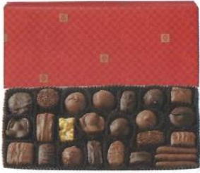
Assorted Chocolates Milk and dark decadence. Delivered in seasonal wrap. 1 lb $30.00 #550318 2 lb $57.00 #550319