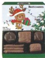
Merry Reindeer Box An irresistible treat. 3.5 oz $11.00 #506959