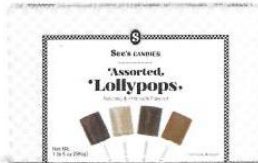
Assorted Lollypops Vanilla, Butterscotch, Café Latte & Chocolate. Approximately 30 lollypops. 1 lb 5 oz $30.00 #506545