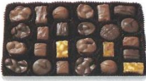
Nuts & Chews Yummy, crunchy and chewy. Delivered in seasonal wrap. 1 lb $30.00 #550334 2 lb $57.00 #550335