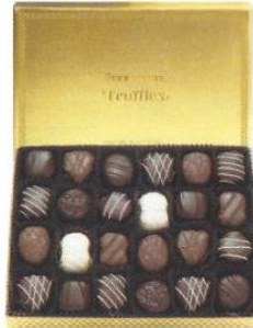
Truffles Wonderfully decadent and rich. 1 lb $33.50 #506541