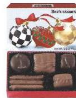
Twinkling Ornaments Box The ultimate stocking stuffer. 3.5 oz $11.00 #506949