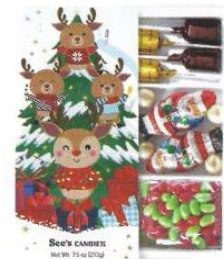
Reindeer Cheer Box An array of adorable bites. 7.5 oz $14.00 #506982