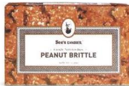
Peanut Brittle Buttery, crunchy and irresistible. 1 lb 8 oz $30.00 #500355