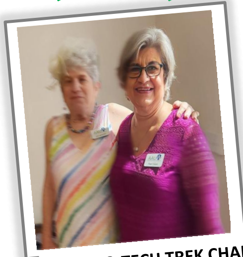
EVENT & TECH TREK CHAIRS