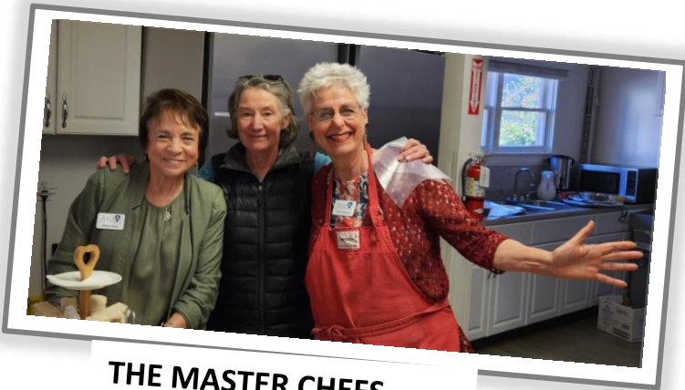
THE MASTER CHEFS