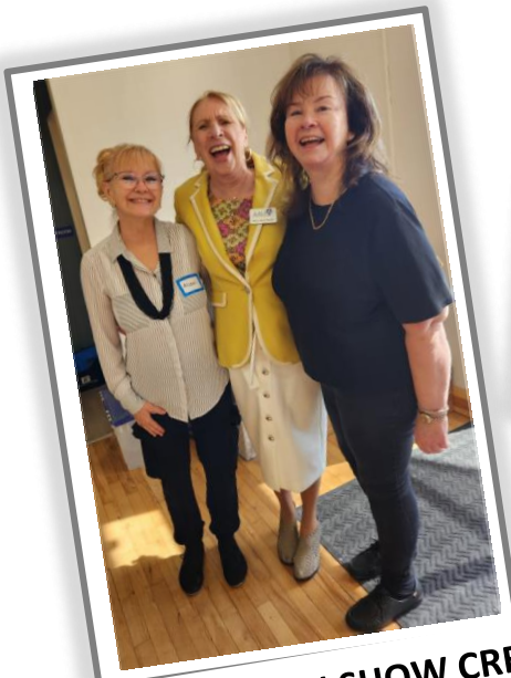
SET-UP/FASHION SHOW CREW