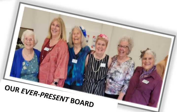
OUR EVER-PRESENT BOARD