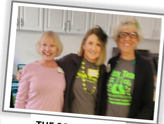
THE SOUS CHEFS