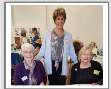
100+ YEARS OF AAUW SERVICE