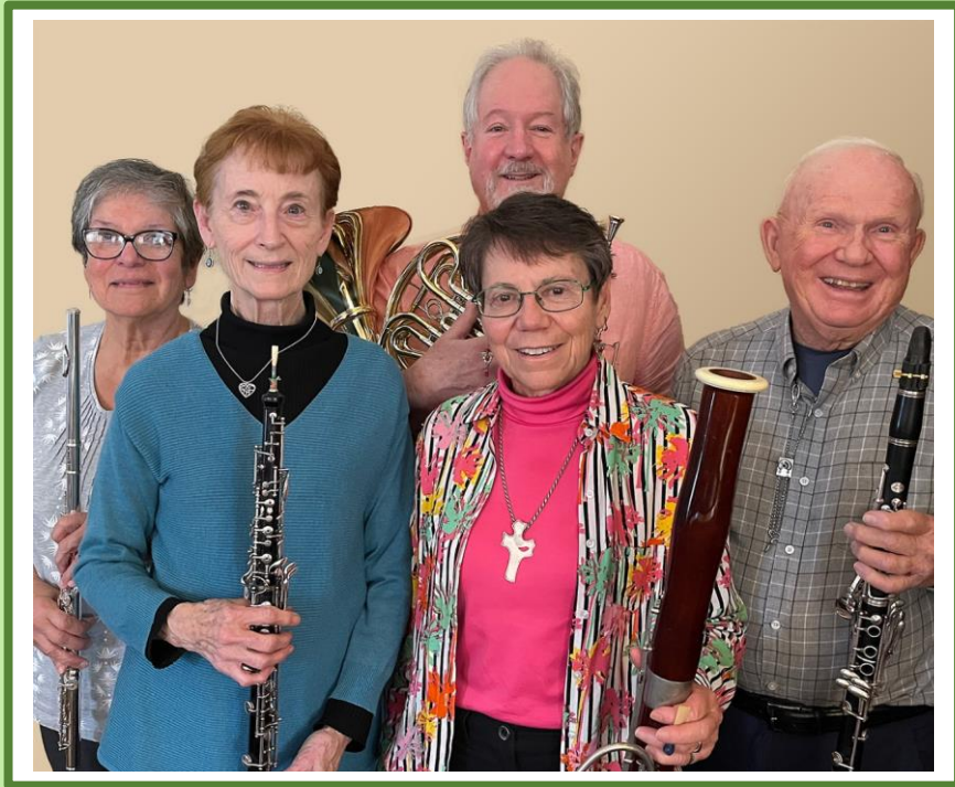
WINDSPRING Woodwind Quintet