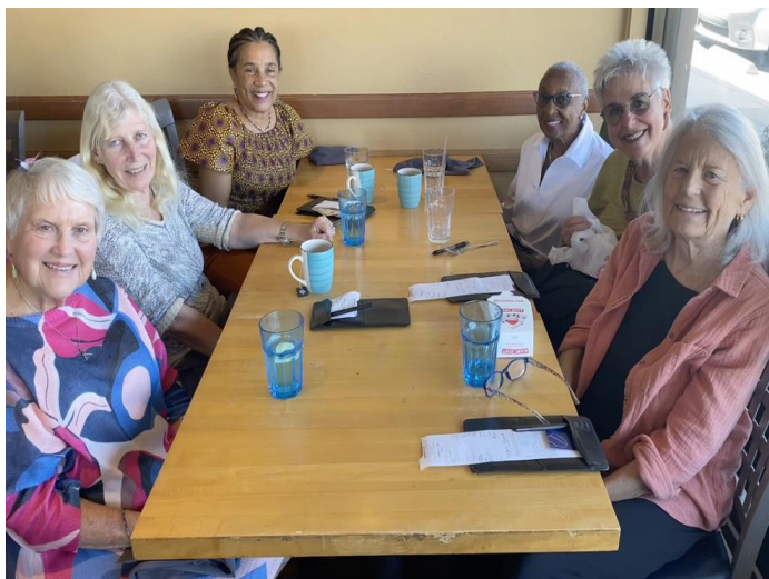
World Lunch @ Burma Place in RB