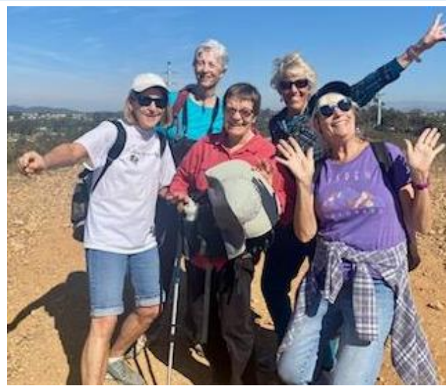
Happy Hikers @ Elliott Chaparral Reserve