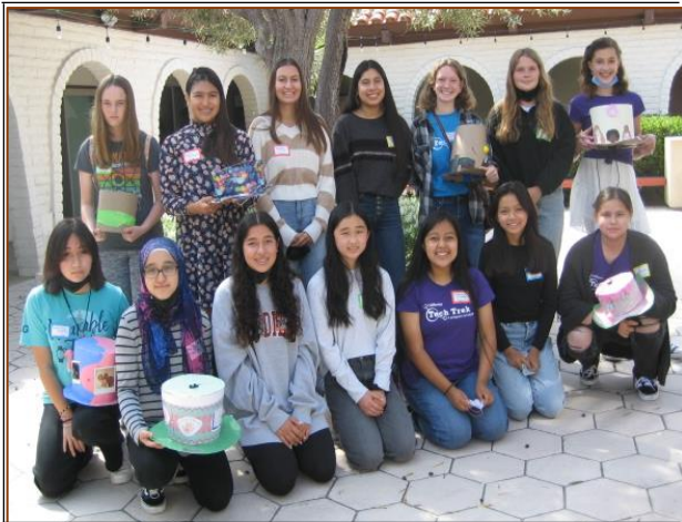
TECH TREKKERS AT SEPTEMBER BRANCH MEETING