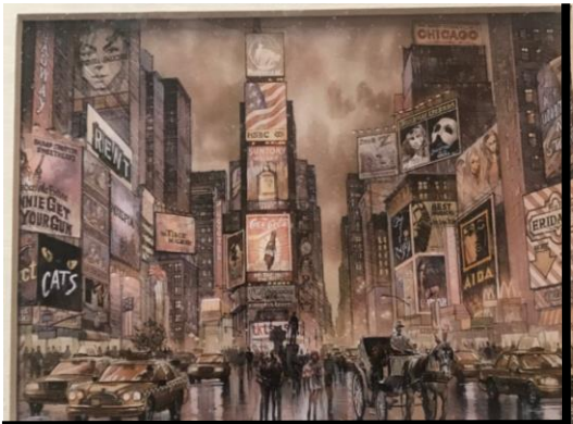
NEW YORK CITY TIMES SQUARE PHOTO