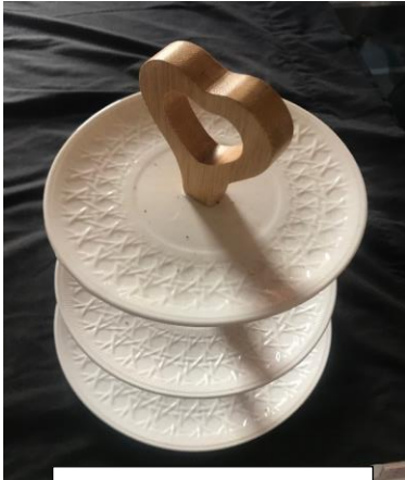
3-TIER COOKIE PLATE