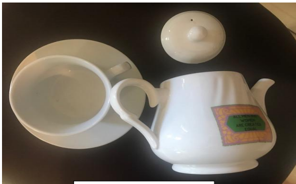
SUFFRAGE TEA POT