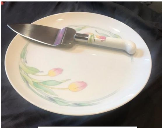
CAKE PLATE W/SERVER