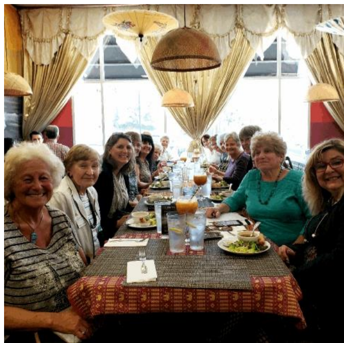
Above: Members of Lunch Bunch enjoy some delicious food at Thai One On in Vista on May 3 rd .