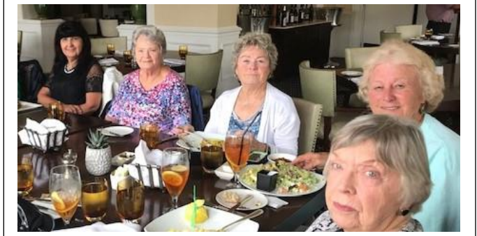
ABOVE: Lunch Bunchers enjoy a meal at Argyle on April 5 th