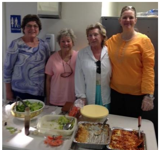
Above: AAUW-COV members served dinner at Solutions for Change on April 10th. Many residents expressed their gratitude and members are happy their small offer makes such a big impact.

Polls opened on April 22nd for voting on new AAUW-CA Board members – President-Elect, CFO and 2 Directors – as well as on the new proposed Public Policy priorities. You should’ve received an e-mail message with instructions on how to vote. Please visit the AAUW-CA website ( aauw-ca.org ) to view nominee profiles on the Governance page, and PP priorities on the Public Policy page. Polls close May 15th – please make your voice heard.